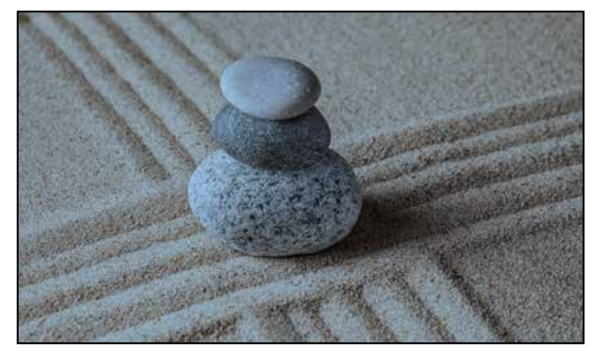
what's the big deal?

Multicollinearity, mentioned Multicollinearity earlier, is a favorite topic among can obscure what researchers. Most people multiple regression in market research think of would otherwise multicollinearity as occurring when the predictors or drivers in a regression analysis are highly correlated with one another. Although that's not the strict mathematical definition, it works for our purposes. Because of the halo effect, multicollinearity is nearly ubiquitous in brand research. So